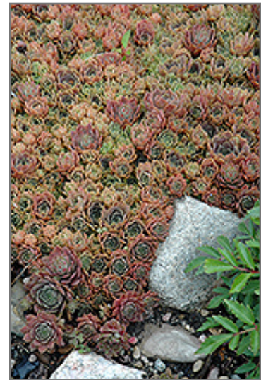
Silverine Hens And Chicks