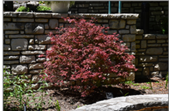
Shaina Japanese Maple

Shaina Japanese Maple is recommended for the following landscape applications;