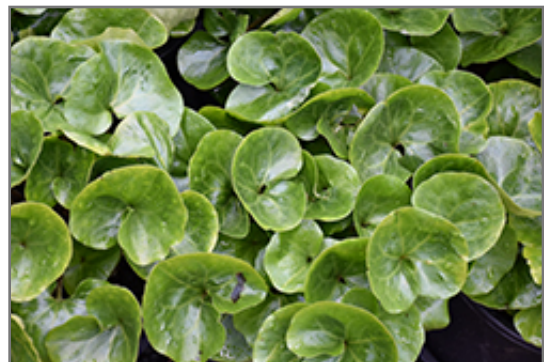
European Wild Ginger foliage