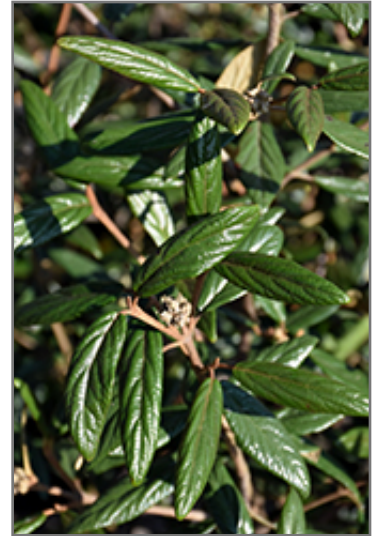
Prague Viburnum foliage

This shrub does best in full sun to partial shade. It prefers to grow in average to moist conditions, and shouldn't be allowed to dry out. It is not particular as to soil type or pH. It is highly tolerant of urban pollution and will even thrive in inner city environments. This particular variety is an interspecific hybrid.