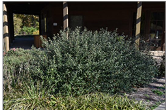
Prague Viburnum