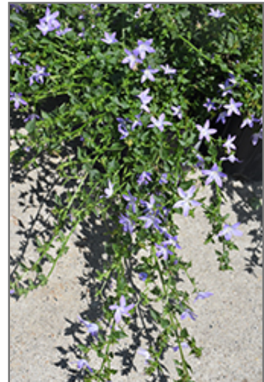
Blue Waterfall Serbian Bellflower in bloom