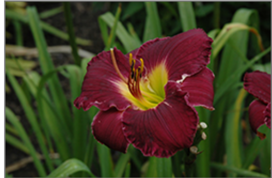
Bela Lugosi Daylily flowers