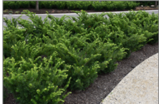
Densiformis Yew