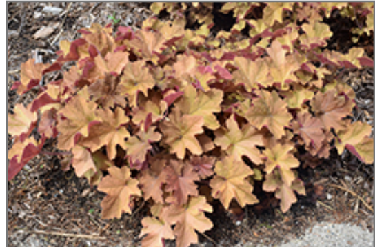
Caramel Coral Bells

Caramel Coral Bells is a fine choice for the garden, but it is also a good selection for planting in outdoor pots and containers. It is often used as a 'filler' in the 'spiller-thriller-filler' container combination, providing a mass of flowers and foliage against which the larger thriller plants stand out. Note that when growing plants in outdoor containers and baskets, they may require more frequent waterings than they would in the yard or garden.