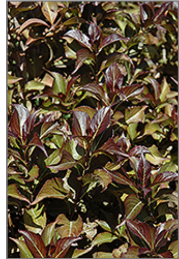
Dark Horse Weigela foliage

Dark Horse Weigela makes a fine choice for the outdoor landscape, but it is also well-suited for use in outdoor pots and containers. Because of its height, it is often used as a 'thriller' in the 'spiller-thriller-filler' container combination; plant it near the center of the pot, surrounded by smaller plants and those that spill over the edges. It is even sizeable enough that it can be grown alone in a suitable container. Note that when grown in a container, it may not perform exactly as indicated on the tag - this is to be expected. Also note that when growing plants in outdoor containers and baskets, they may require more frequent waterings than they would in the yard or garden.