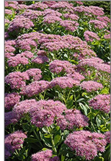
Brilliant Stonecrop flowers

Brilliant Stonecrop is recommended for the following landscape applications;