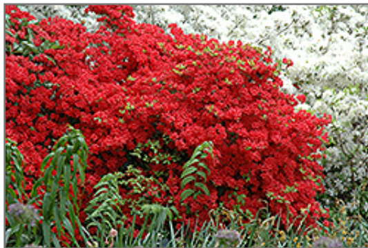
Stewartstonian Azalea in bloom