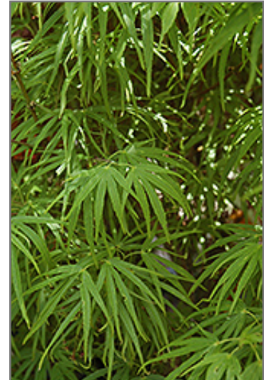
Scolopendrifolium Japanese Maple foliage

Scolopendrifolium Japanese Maple is recommended for the following landscape applications;