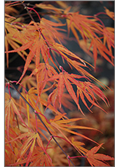
Scolopendrifolium Japanese Maple in fall

Scolopendrifolium Japanese Maple is a fine choice for the yard, but it is also a good selection for planting in outdoor pots and containers. Its large size and upright habit of growth lend it for use as a solitary accent, or in a composition surrounded by smaller plants around the base and those that spill over the edges. It is even sizeable enough that it can be grown alone in a suitable container. Note that when grown in a container, it may not perform exactly as indicated on the tag - this is to be expected. Also note that when growing plants in outdoor containers and baskets, they may require more frequent waterings than they would in the yard or garden.