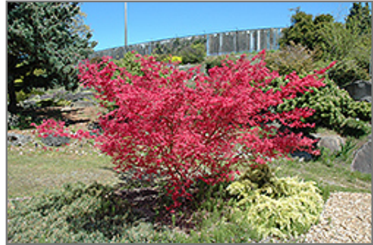
Shindeshojo Japanese Maple in spring

This tree does best in full sun to partial shade. You may want to keep it away from hot, dry locations that receive direct afternoon sun or which get reflected sunlight, such as against the south side of a white wall. It prefers to grow in average to moist conditions, and shouldn't be allowed to dry out. It is not particular as to soil pH, but grows best in rich soils. It is somewhat tolerant of urban pollution, and will benefit from being planted in a relatively sheltered location. Consider applying a thick mulch around the root zone in winter to protect it in exposed locations or colder microclimates. This is a selected variety of a species not originally from North America.