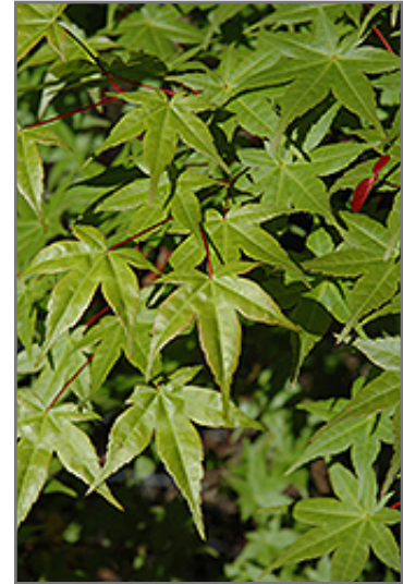
Shindeshojo Japanese Maple foliage

Shindeshojo Japanese Maple is recommended for the following landscape applications;