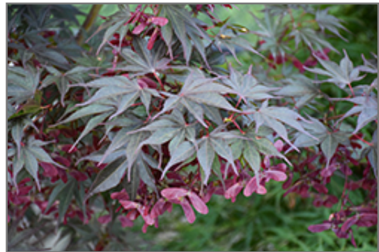
Red Dawn Full Moon Maple foliage