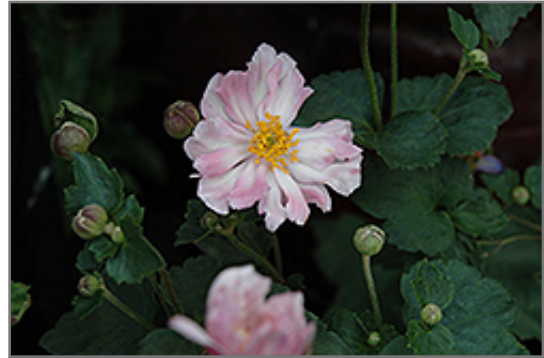
Queen Charlotte Anemone flowers