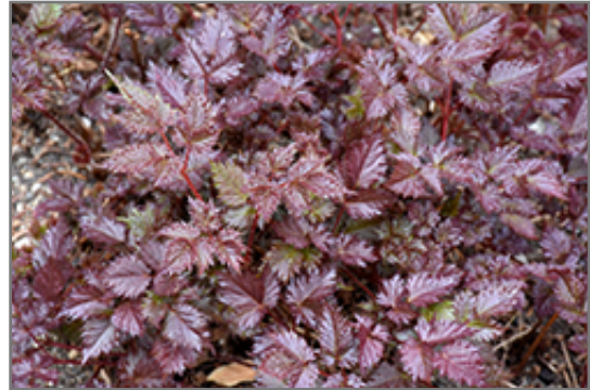
Delft Lace Astilbe foliage