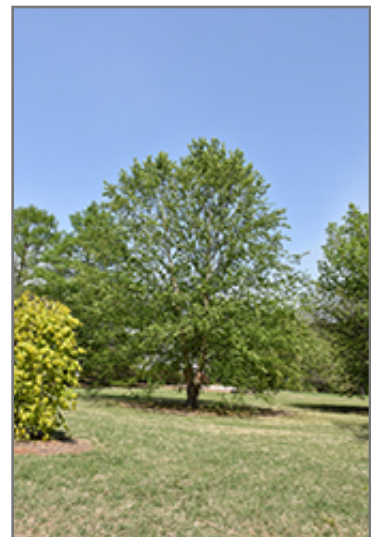
Dura Heat River Birch