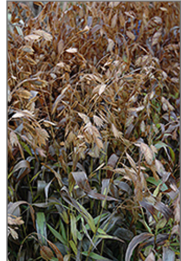
Northern Sea Oats in fall

Northern Sea Oats is recommended for the following landscape applications;