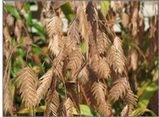
Northern Sea Oats fruit

Northern Sea Oats will grow to be about 4 feet tall at maturity, with a spread of 30 inches. Its foliage tends to remain dense right to the ground, not requiring facer plants in front. It grows at a medium rate, and under ideal conditions can be expected to live for approximately 10 years. As an herbaceous perennial, this plant will usually die back to the crown each winter, and will regrow from the base each spring. Be careful not to disturb the crown in late winter when it may not be readily seen!