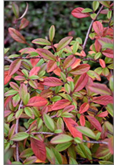
Scarlet Leader Willowleaf Cotoneaster in fall

This shrub does best in full sun to partial shade. It is very adaptable to both dry and moist growing conditions, but will not tolerate any standing water. It is not particular as to soil type or pH, and is able to handle environmental salt. It is highly tolerant of urban pollution and will even thrive in inner city environments. This is a selected variety of a species not originally from North America.