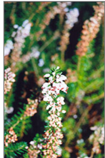
Scotch Heather flowers