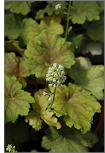
Electra Coral Bells flowers

Electra Coral Bells is recommended for the following landscape applications;