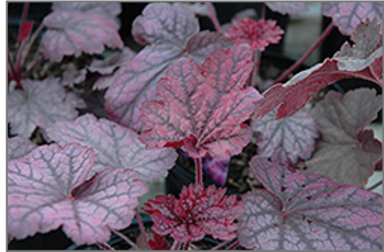
Midnight Bayou Coral Bells foliage

Midnight Bayou Coral Bells is recommended for the following landscape applications;