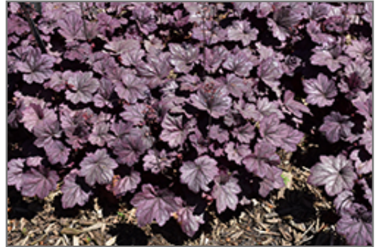
Sugar Plum Coral Bells

Sugar Plum Coral Bells will grow to be about 12 inches tall at maturity extending to 24 inches tall with the flowers, with a spread of 18 inches. When grown in masses or used as a bedding plant, individual plants should be spaced approximately 15 inches apart. Its foliage tends to remain dense right to the ground, not requiring facer plants in front. It grows at a medium rate, and under ideal conditions can be expected to live for approximately 10 years. As an evergreen perennial, this plant will typically keep its form and foliage year-round.