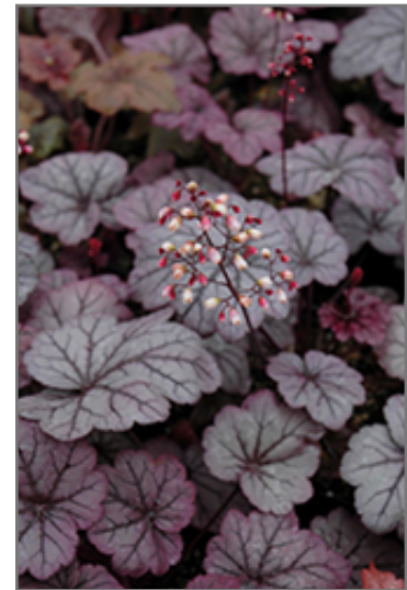
Sugar Plum Coral Bells flowers