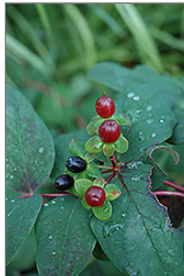
Albury Purple St. John's Wort fruit

Albury Purple St. John's Wort makes a fine choice for the outdoor landscape, but it is also well-suited for use in outdoor pots and containers. With its upright habit of growth, it is best suited for use as a 'thriller' in the 'spiller-thriller-filler' container combination; plant it near the center of the pot, surrounded by smaller plants and those that spill over the edges. It is even sizeable enough that it can be grown alone in a suitable container. Note that when grown in a container, it may not perform exactly as indicated on the tag - this is to be expected. Also note that when growing plants in outdoor containers and baskets, they may require more frequent waterings than they would in the yard or garden.