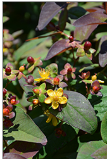
Albury Purple St. John's Wort flowers

Albury Purple St. John's Wort is recommended for the following landscape applications;