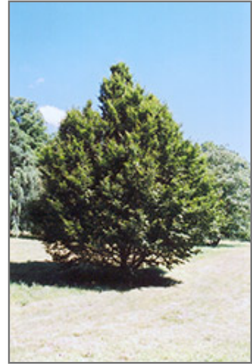
American Hornbeam

The American Hornbeam is recommended for the following landscape applications;