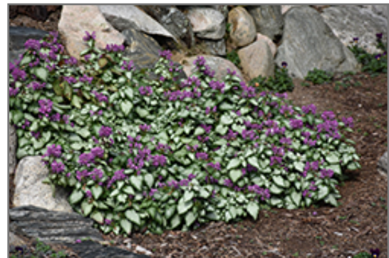
Purple Dragon Spotted Dead Nettle in bloom