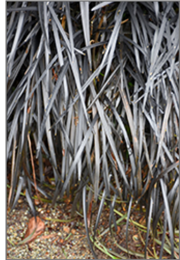
Black Mondo Grass foliage

Black Mondo Grass is a fine choice for the garden, but it is also a good selection for planting in outdoor pots and containers. It is often used as a 'filler' in the 'spiller-thriller-filler' container combination, providing a mass of flowers and foliage against which the thriller plants stand out. Note that when growing plants in outdoor containers and baskets, they may require more frequent waterings than they would in the yard or garden.