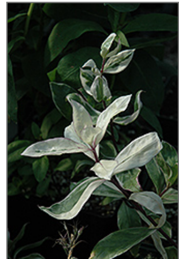
Montrose Tricolor Phlox foliage