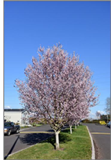
Krauter Vesuvius Plum in bloom

This tree will require occasional maintenance and upkeep, and is best pruned in late winter once the threat of extreme cold has passed. It is a good choice for attracting birds to your yard. Gardeners should be aware of the following characteristic(s) that may warrant special consideration;