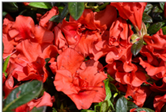
Encore Autumn Embers Azalea flowers

Encore Autumn Embers Azalea will grow to be about 3 feet tall at maturity, with a spread of 4 feet. It has a low canopy. It grows at a slow rate, and under ideal conditions can be expected to live for 40 years or more.