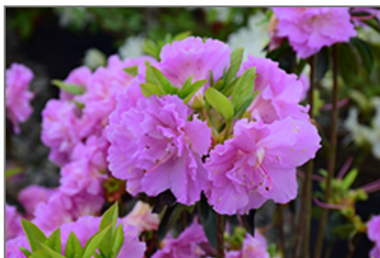
Elsie Lee Azalea flowers