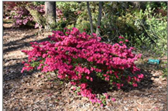
Girard's Fuchsia Evergreen Azalea in bloom