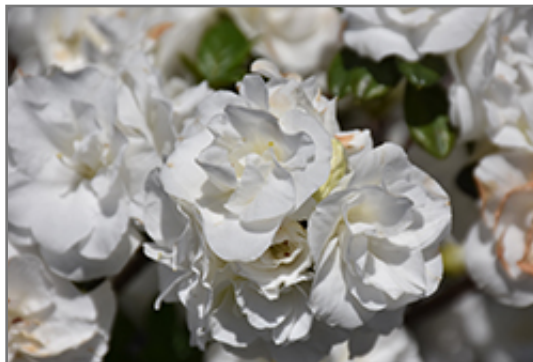
Hardy Gardenia Azalea flowers

Hardy Gardenia Azalea will grow to be about 3 feet tall at maturity, with a spread of 3 feet. It has a low canopy. It grows at a slow rate, and under ideal conditions can be expected to live for 40 years or more.