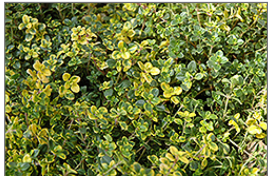
Doone Valley Thyme