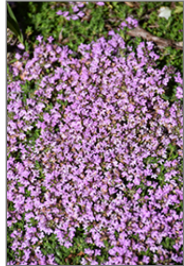
Elfin Creeping Thyme flowers

Elfin Creeping Thyme is a dense herbaceous evergreen perennial with a ground-hugging habit of growth. It brings an extremely fine and delicate texture to the garden composition and should be used to full effect.