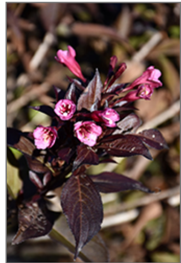
Fine Wine Weigela flowers