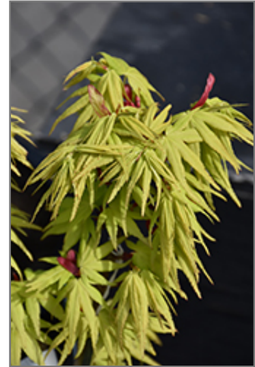
Mikawa Yatsubusa Japanese Maple foliage

Mikawa Yatsubusa Japanese Maple is recommended for the following landscape applications;