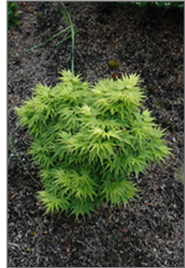
Mikawa Yatsubusa Japanese Maple

Mikawa Yatsubusa Japanese Maple is a fine choice for the yard, but it is also a good selection for planting in outdoor pots and containers. With its upright habit of growth, it is best suited for use as a 'thriller' in the 'spiller-thriller-filler' container combination; plant it near the center of the pot, surrounded by smaller plants and those that spill over the edges. It is even sizeable enough that it can be grown alone in a suitable container. Note that when grown in a container, it may not perform exactly as indicated on the tag - this is to be expected. Also note that when growing plants in outdoor containers and baskets, they may require more frequent waterings than they would in the yard or garden.