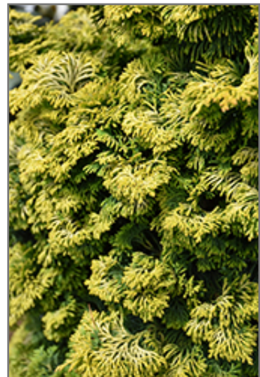
Dwarf Golden Hinoki Falsecypress foliage