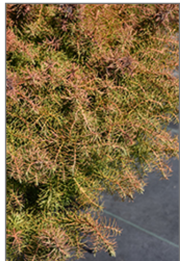
Mushroom Japanese Cedar foliage