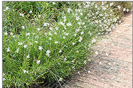
Whirling Butterflies Gaura in bloom