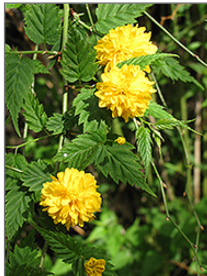
Double Flowered Japanese Kerria flowers