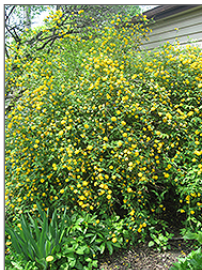
Double Flowered Japanese Kerria