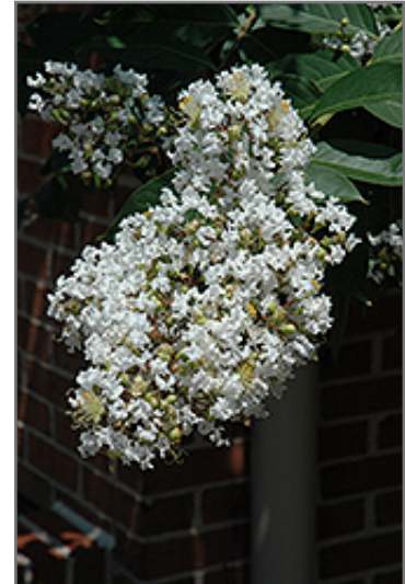
Natchez Crape Myrtle flowers

This is a relatively low maintenance tree, and is best pruned in late winter once the threat of extreme cold has passed. Deer don't particularly care for this plant and will usually leave it alone in favor of tastier treats. It has no significant negative characteristics.