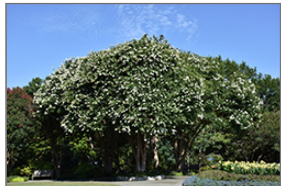
Natchez Crape Myrtle in bloom