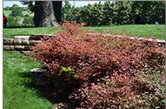
Flirt Nandina

Flirt Nandina is recommended for the following landscape applications;