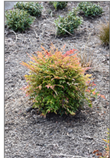
Gulf Stream Dwarf Nandina