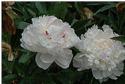
Avalanche Peony flowers