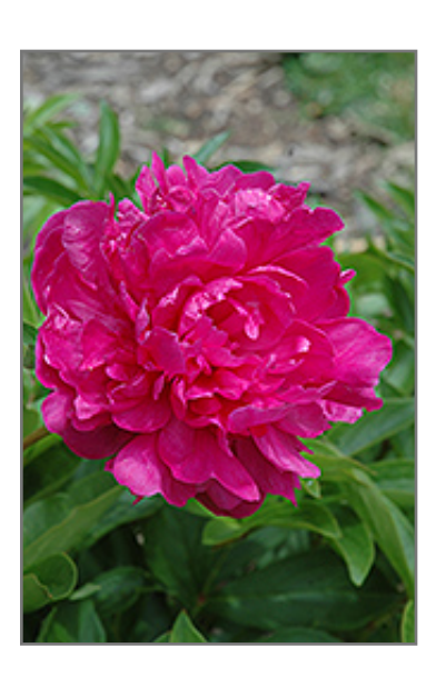
Rubra Superba Peony flowers