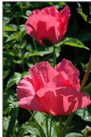
Raspberry Queen Poppy flowers