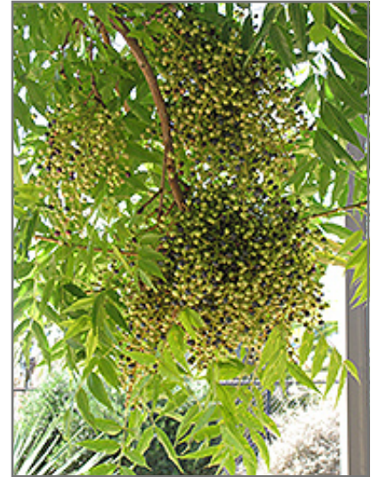
Chinese Pistache fruit

This tree should only be grown in full sunlight. It is very adaptable to both dry and moist growing conditions, but will not tolerate any standing water. It is not particular as to soil type or pH. It is highly tolerant of urban pollution and will even thrive in inner city environments. This species is not originally from North America.