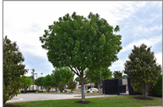
Chinese Pistache