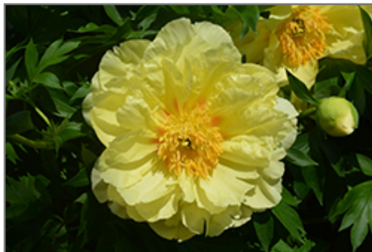
Sequestered Sunshine Peony in bloom