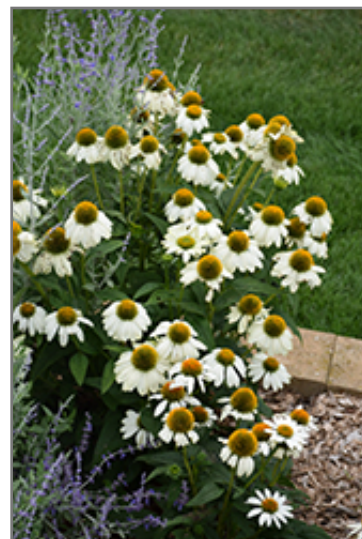
PowWow White Coneflower in bloom