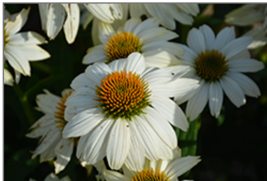
PowWow White Coneflower flowers

This is a relatively low maintenance plant, and is best cleaned up in early spring before it resumes active growth for the season. It is a good choice for attracting birds and butterflies to your yard, but is not particularly attractive to deer who tend to leave it alone in favor of tastier treats. It has no significant negative characteristics.